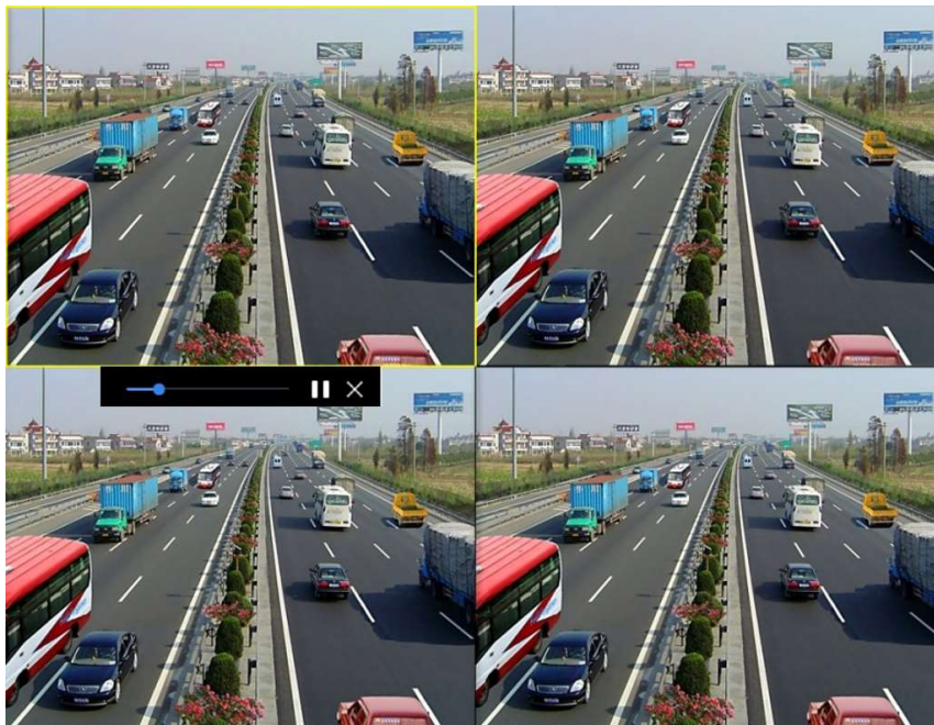
Figure 11-1 Playback Interface