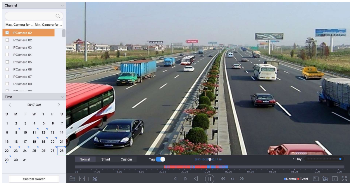
Figure 11-2 Playback Interface